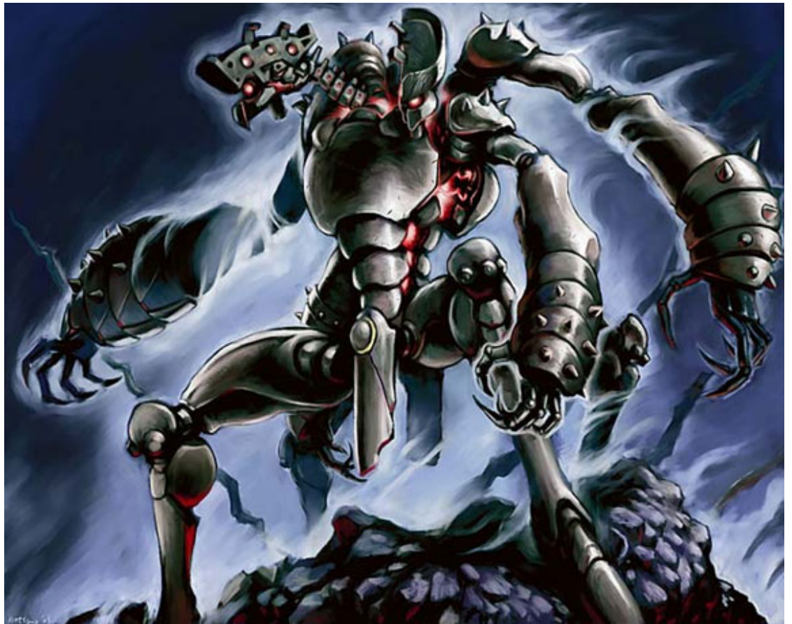
Gemini Engine final art by Nottsuo